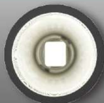
Other PL V LED Lamp

The PL V lamp features a patent pending fully round design. Compared to other square shaped PL vertical lamps, the GREEN CREATIVE PL V improves the overall light output and aesthetics of the fixture.