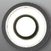
GREEN CREATIVE PL V LED Lamp