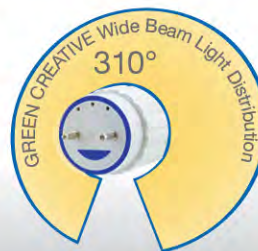
Lamp Front View

This lamp uses an innovative coated glass design that diffuses heat and light more evenly than plastic. As a result of its compact light engine, this lamp produces a light emitting area of 310°. This wider beam angle improves a fixture's total light distribution and creates a more complete lighting effect.