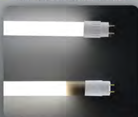
Other LED Tubes