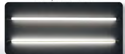
Lamp Back View