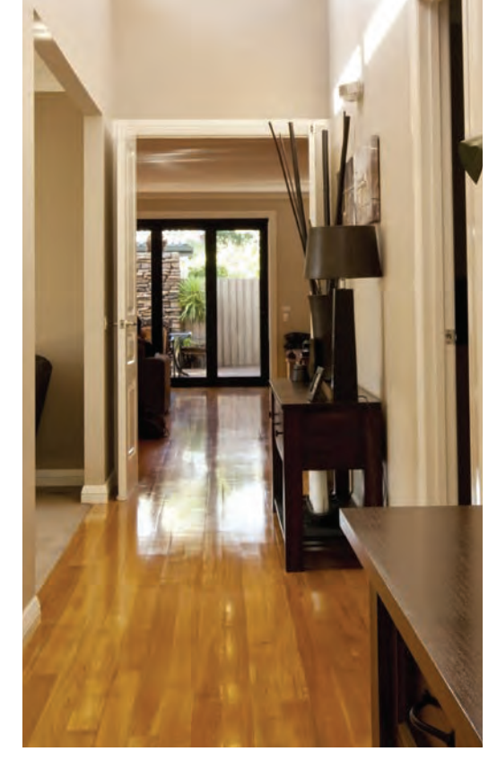
Able to mount to ceiling or wall