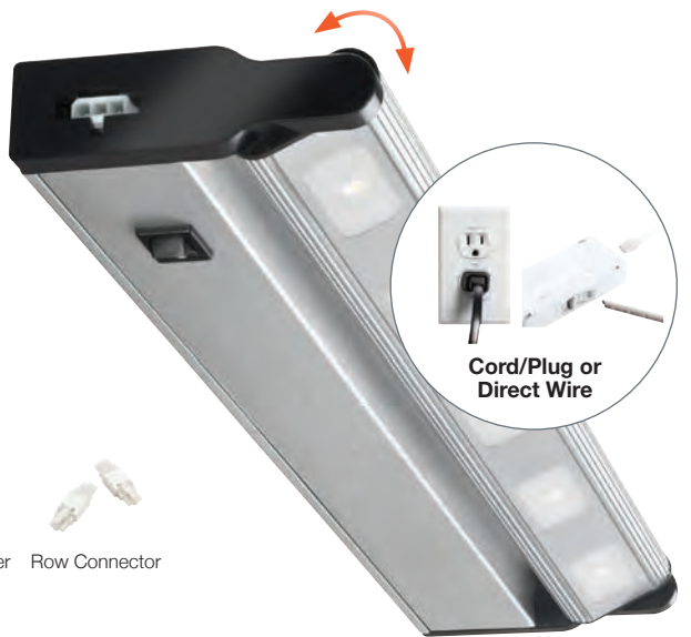
Cord/Plug or Direct Wire