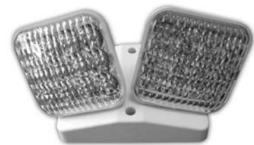
Double Lamp with No Options