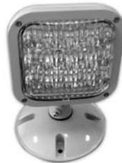
Single Lamp with Weatherproof (WP) Option