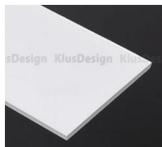
cover type HSP47 frosted (17051) clear (17062)