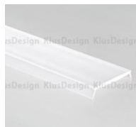
cover type LIGER 22 frosted matte (17032) MUN 22 clear matte (17042)