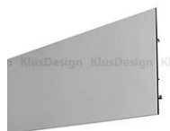
extrusion ATRA (B7454ANODA)