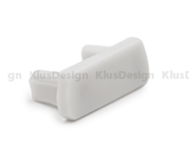
end cap ONISA (24100)