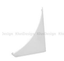
end cap TELIT-L right (24180) left (24181)