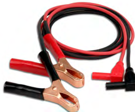
LSP-MBTLA2 (ideal for large batteries)