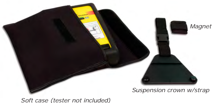
Soft case (tester not included)