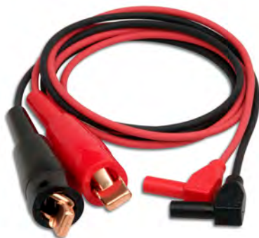
LSC-MBTLA2 (standard on MBT-LA2)