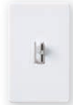
Ariadni®/C•L Gloss colors Coming Soon