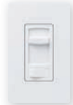
Skylark Contour™/C•L* Gloss colors