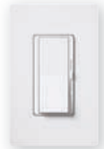
Diva®/C•L Gloss and Satin Colors®