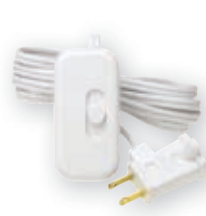
Credenza®/C•L Black (BL), White (WH), and Brown (BR)