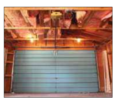
Ideal for: Laundry Rooms, Closets, Garages, Kitchens, Home Offices