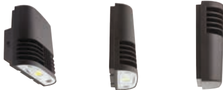
Wiring Box for conduit