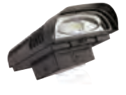
**Top Visor & Vandal Guard

** Flood mounting accessories sold separately. Top Visor and Vandal Guard included with purchase of any flood mount accessory.