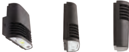
Wiring Box for conduit