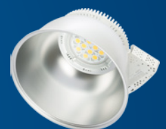
Anodized Matte Aluminum Reflector