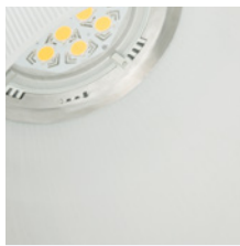
White Acrylic Reflector