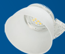
White Acrylic Reflector