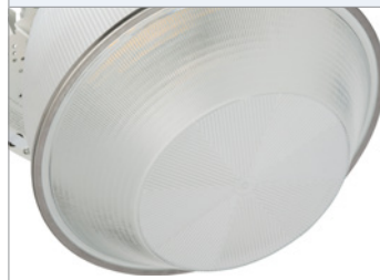
Acrylic Clear Prismatic Drop Lens