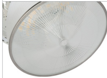
Acrylic Clear Conical Bottom Lens