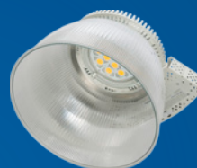
Clear Acrylic Reflector

Reap the benefits of long-term financial savings with lower energy bills and reduced maintenance costs — all by replacing those difficult-to-reach, elevated mounted fluorescent and HID fixtures with the CXB Series.