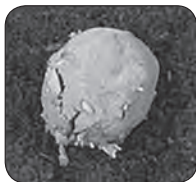
Seed BALL Day 1 Semilla día 1 Semence jour 1 Saatgutkugel Tag 1

*HINWEIS: Das Wachstum kann je nach der Pflanzenart und den Anpflanzungsbedingungen in unterschiedlicher Weise verlaufen.