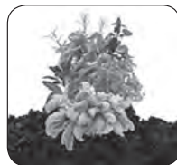
Day 21* Día 21* Jour 21* Tag 21*

for reordering additional seed balls, see retailer information on: www.JumpStartseedstart.com