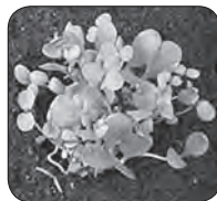
Day 5* Día 5* Jour 5* Tag 5*