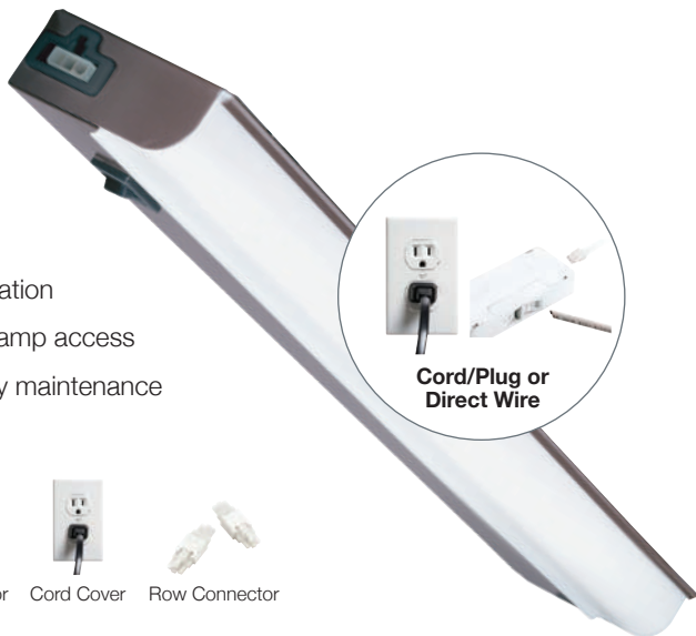
Cord/Plug or Direct Wire