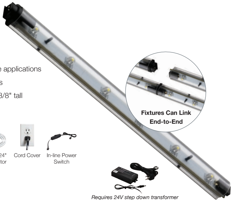
Fixtures Can Link End-to-End