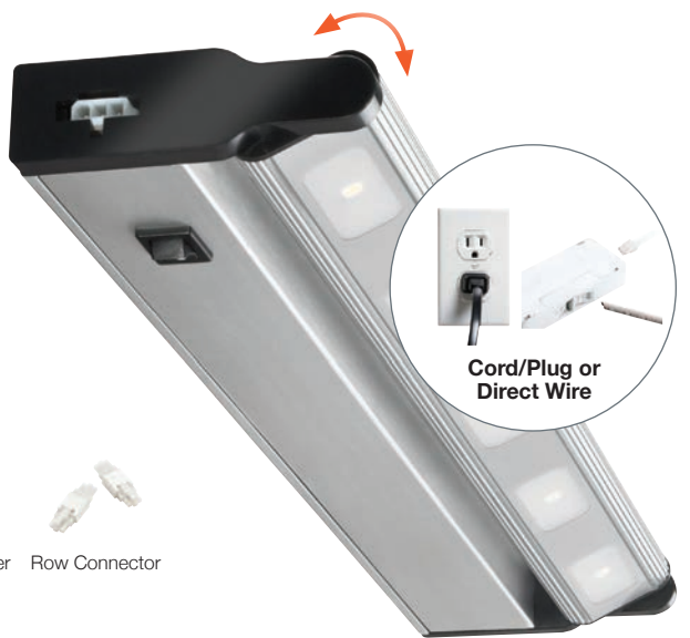
Cord/Plug or Direct Wire