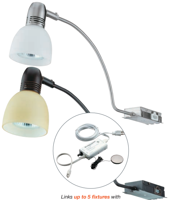
Links up to 5 fixtures with optional 3-way dimmer Model No. LOC 3D M6 (sold separately)