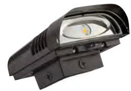
Top Visor and Vandal Guard included with accessories