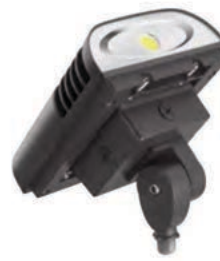
OLWX1THK Knuckle – size 1