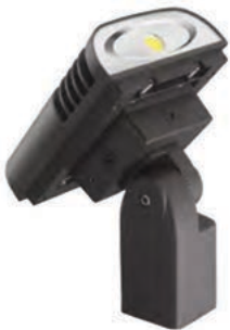
OLWX1TS Slipfitter – size 1