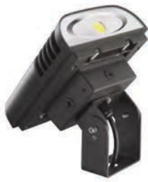
OLWX1YK Yoke – size 1