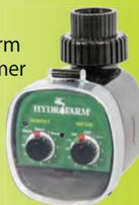
Hydrofarm Water Timer