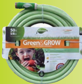
Garden Hose, 50 ft