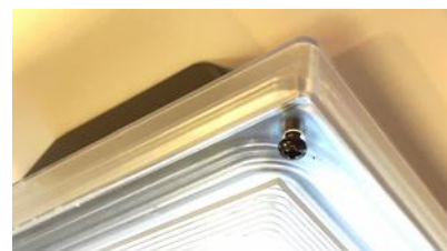
Exclusive Weather Resistant Shield for severe weather conditions.