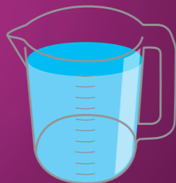
1 GALLON water

Bloombastic seems expensive if you only look at the sticker price. It is highly concentrated, so you only need 2-4ml of Bloombastic per Gallon feed water. This means that a single 325ml bottle will make over 170 Gallon of nutrient rich feed water. Bloombastic is a very affordable replacement for several supplements that you may currently be using and you'll achieve improved results.