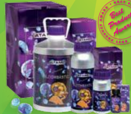
Available in: 80ml, 325ml, 1250ml and 5,5L