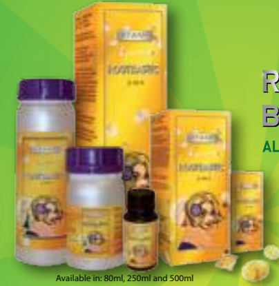
Available in: 80ml, 250ml and 500ml

Atami... transforms beginners into PROFESSIONALS and professionals into CHAMPIONS!!!