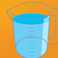
1 GALLON water

Save: 0.13€ and 0.26€ by using lower dosage and getting better results than other root products. When you use Rootbastic instead of other products you do not only get at least 3 times a treatment solution out of it but also you will save 0.24€ a gallon in comparison with other products.