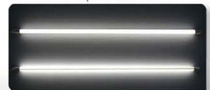
Lamp Back View