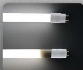
Other LED Tubes