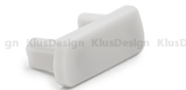
End Cap ONISA (24100)