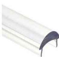
cover type S clear (00220) satin (17111)