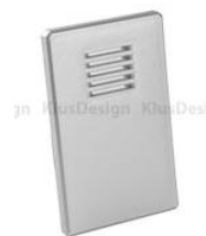
end cap DESIN MET (24151)