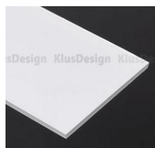
cover type HSP47 frosted (17051) clear (17062)