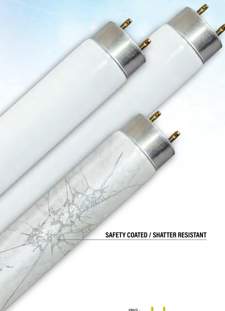
SAFETY COATED / SHATTER RESISTANT