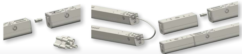
QWIKLINK Connector QWIKLINK Cable QWIKLINK Sensor

Easily and seamlessly connect up to 64' of fixtures with the QWIKLINK connection system. The QWIKLINK connector provides line voltage and 0-10V dimming between fixtures. The QWIKLINK cable comes in two lengths (7.9in. & 5ft.) and allows for angled and distant fixture connection. The QWIKLINK sensor integrates with a single fixture or an entire row for occupancy sensing and dimming.