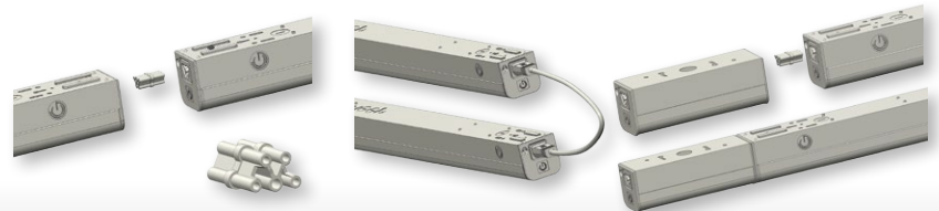
QWIKLINK Connector QWIKLINK Cable QWIKLINK Sensor

Easily and seamlessly connect up to 64' of fixtures with the QWIKLINK connection system. The QWIKLINK connector provides line voltage and 0-10V dimming between fixtures. The QWIKLINK cable comes in two lengths (7.9in. & 5ft.) and allows for angled and distant fixture connection. The QWIKLINK sensor integrates with a single fixture or an entire row for occupancy sensing and dimming.