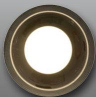
GREEN CREATIVE PLS V LED Lamp