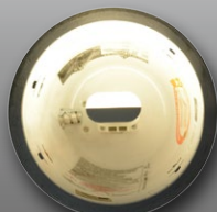
Other PLS LED Lamp

The PLS V lamp features a patent pending fully round design. Compared to other PLS lamps, the GREEN CREATIVE PLS V improves the overall light output and aesthetics of the fixture, especially in cans.