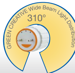
Lamp Front View

This lamp uses an innovative glass design that diffuses heat and light more evenly. As a result of its compact light engine, this lamp produces a light emitting area of 310°. This wider beam angle improves a fixture's total light distribution and creates a more complete lighting effect.