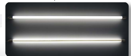
Lamp Back View