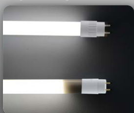
Other LED Tubes