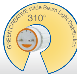
Lamp Front View

This lamp uses an innovative glass design that diffuses heat and light more evenly. As a result of its compact light engine, this lamp produces a light emitting area of 310°. This wider beam angle improves a fixture's total light distribution and creates a more complete lighting effect.