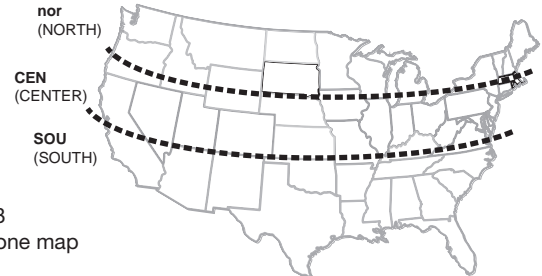
Figure 3 Astro zone map