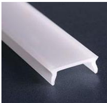
cover type K frosted (1547) clear (1548) cover type LIGER frosted matte (17031)