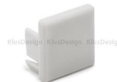
end cap PDS-ZM 24145