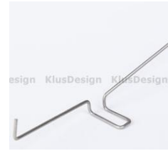
spring GP (00293)