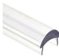
cover type S satin (17111)