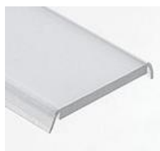
cover type HS22 frosted (17011) clear (17022)