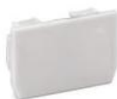
KOZUS end cap without hole (24148)