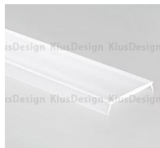
cover type LIGER 22 frosted matte (17032)