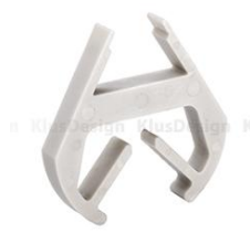
POR clip (24014)