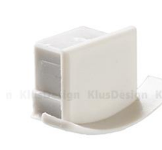
end cap without hole (24021)