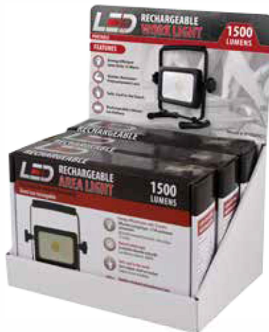
Display holds 3 products