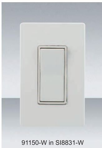
91150-W in SI8831-W