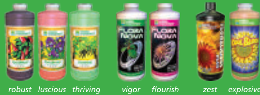
robust luscious thriving vigor flourish zest explosive

Keep it simple and enjoy your thriving garden.