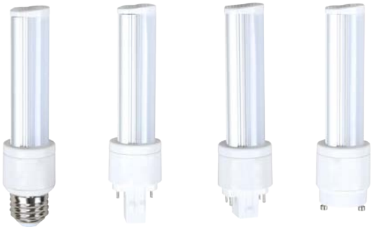
6W E26 6W GX23 6W G24q 6W GU24