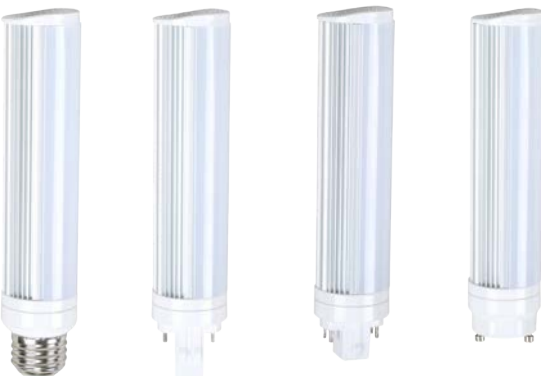
8W E26 8W GX23 8W G24q 8W GU24