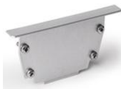
end cap SEKODU KPL. (24107), SEKODU-MET KPL. (24108)