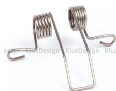
spring KMA (00838)