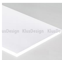
cover SZER (17081)