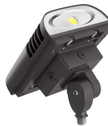
OLWX1THK Knuckle – size 1