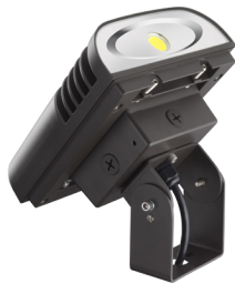
OLWX1YK Yoke – size 1