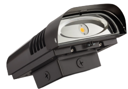
Top Visor and Vandal Guard included with accessories