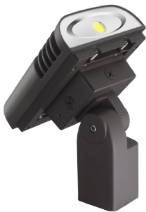
OLWX1TS Slipfitter – size 1