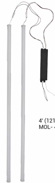
4' (1219mm) LED Lightbar MOL- 44" (1118mm)

The UR Series upgrade kit ships as two components: lightbars and driver. Each component must be ordered separately.