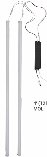
4' (1219mm) LED Lightbar MOL- 44" (1118mm)

The UR Series upgrade kit ships as two components: lightbars and driver. Each component must be ordered separately.