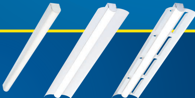
LS4™ LED Surface Ambient Luminaire

Suitable for surface, suspended, cove or pendant mounting as individual luminaires or in continuous rows, the LS Series allows for application and installation flexibility. A full range of lumen options, up to 10,000, the compact form of the LS Series, and optional reflectors, all combine for a fresh approach to traditional fluorescent strip and wrap fixtures.