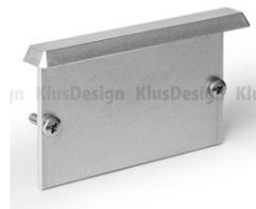
end cap SEKOMA KPL. (24109), SEKOMA-MET KPL. (24110)