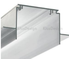
extrusion TESE KPL. (18021) , TES-16 (18022)