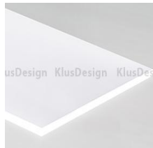
cover SZER (17081)