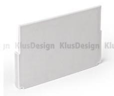
end cap TESE (24047)