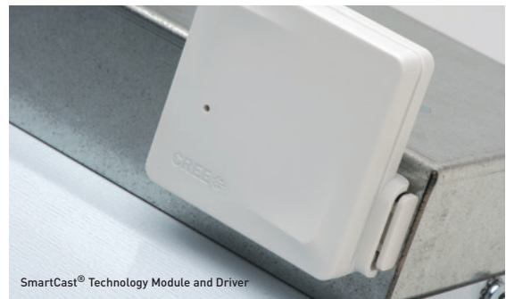
SmartCast® Technology Module and Driver