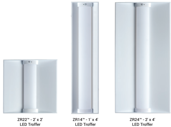
ZR22™ - 2' x 2' LED Troffer