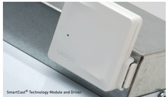
SmartCast® Technology Module and Driver