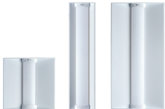
ZR22™ - 2' x 2' LED Troffer