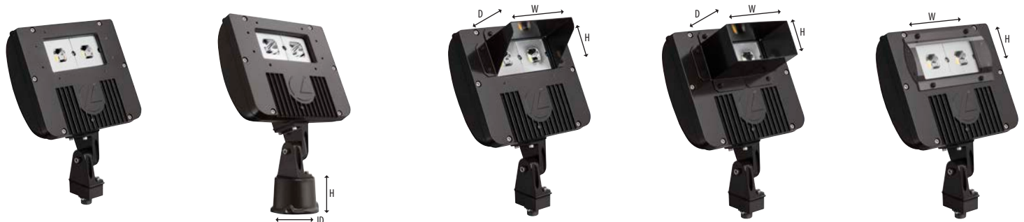
THK - Knuckle with 1/2" NPS threaded pipe