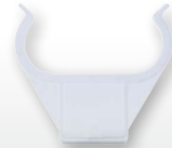
Support clip included